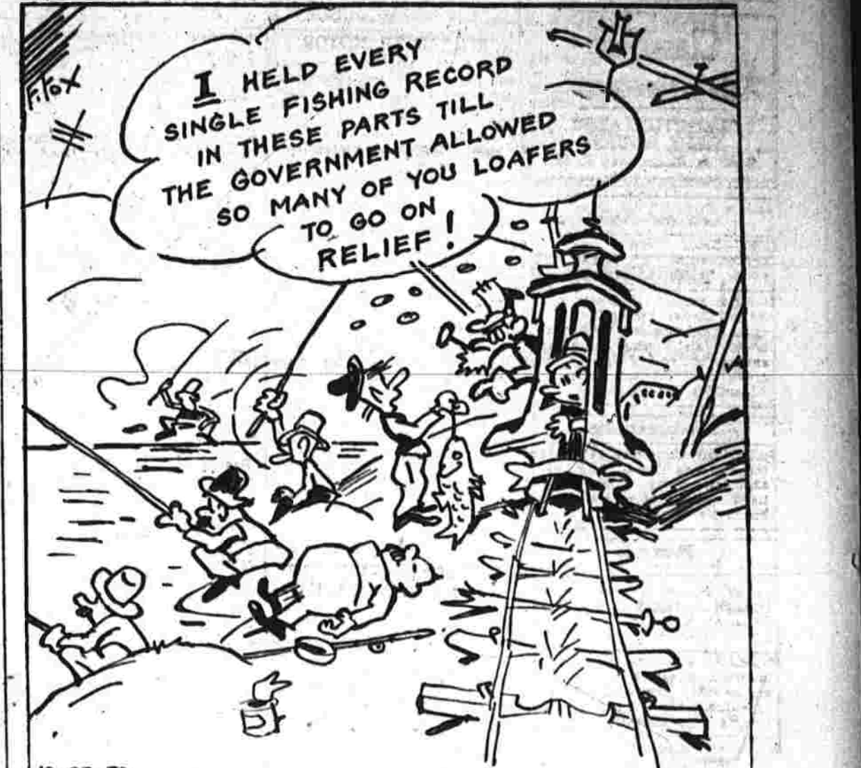
(Illustrated by The Ball System, Inc.)