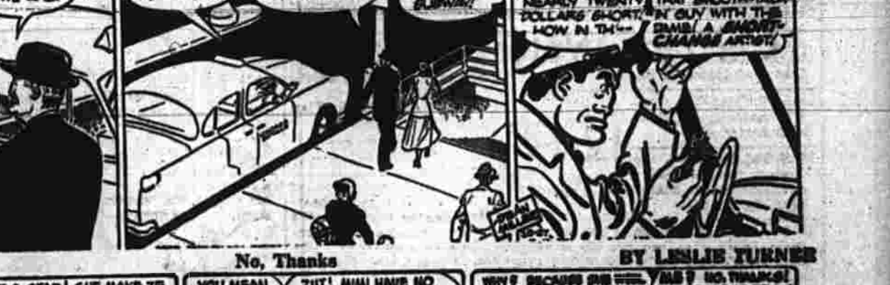
Too Little—And Too Late