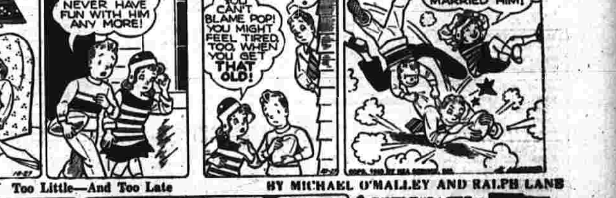
More Than One Way