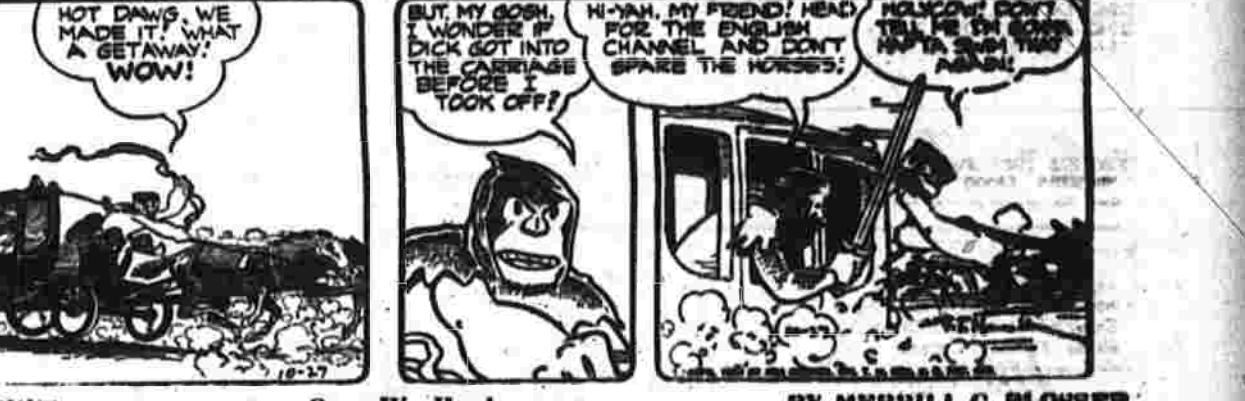
Going to Town